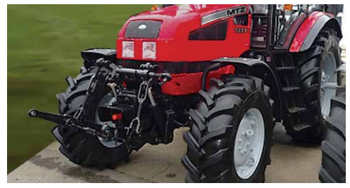
Available front hitch and PTO package